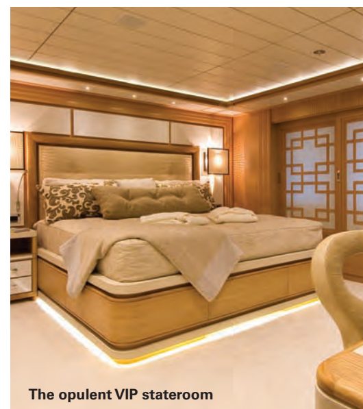
The opulent VIP stateroom

Since leaving the shipyard in March, Yogi has covered about 5,000 nautical miles and, according to her captain Jean-Louis Carrel, she handles well at sea.