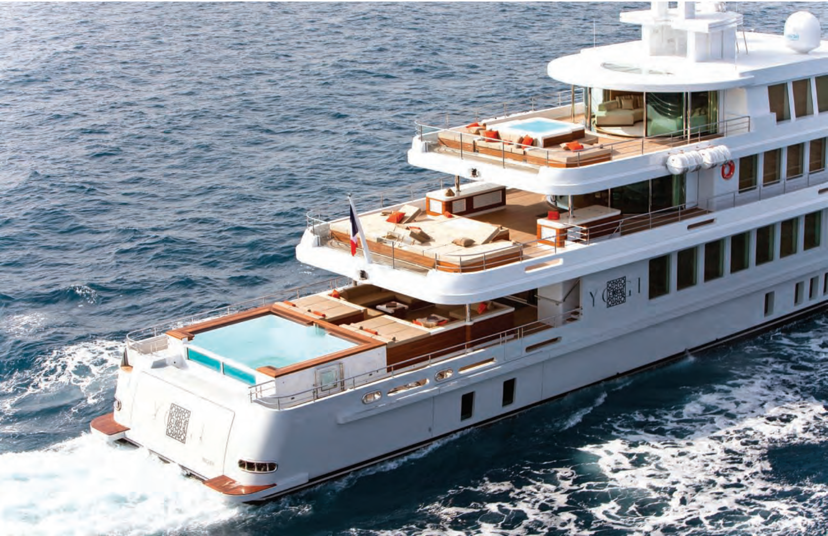
Yogi's unique design connects guests with the ocean

meters) and formal dining area (60 square meters) on the main deck, which are the more formal spaces of the yacht; whilst the playlounge on Yogi's sundeck, and upper deck lounge, along with the remainder of Yogi's spaces, are all designed for casual and comfortable relaxation. There are two cinema areas onboard, one on deck where the sun