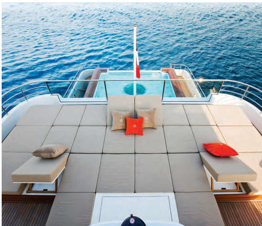
Yogi's decks are designed with relaxation in mind