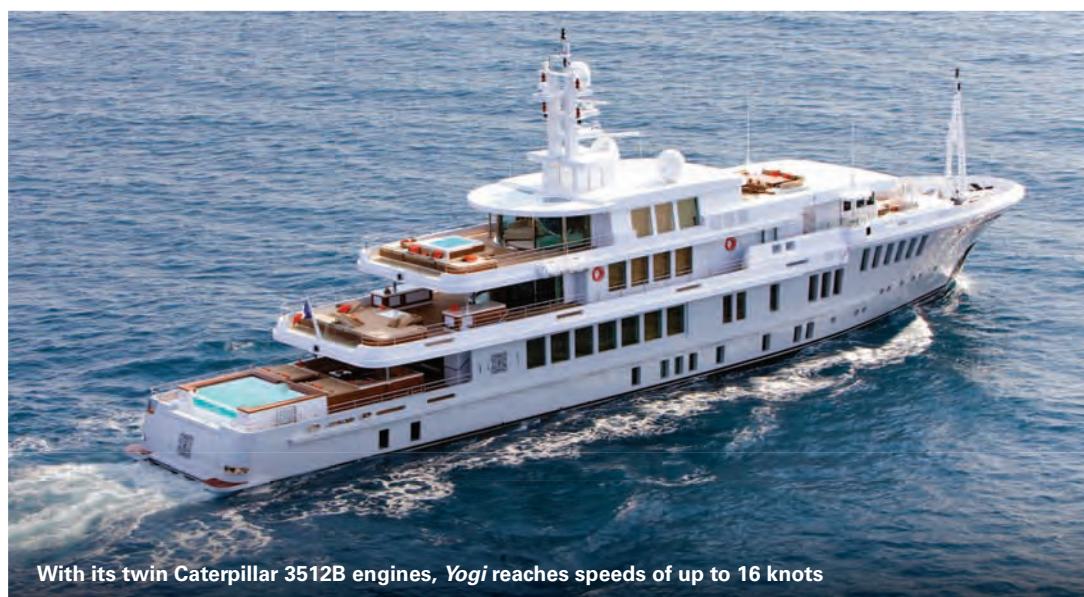
With its twin Caterpillar 3512B engines, Yogi reaches speeds of up to 16 knots

pad can be adjusted to provide comfortable seating towards the large screen; whilst forward in the main saloon, guests can watch movies while relaxing on one of the large sofas.