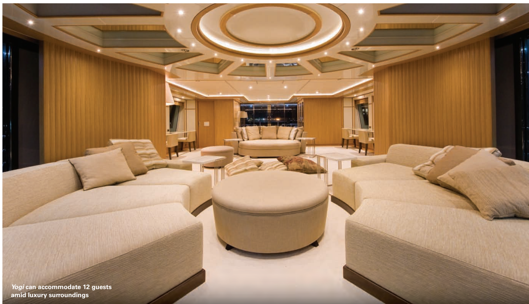
Yogi can accommodate 12 guests amid luxury surroundings