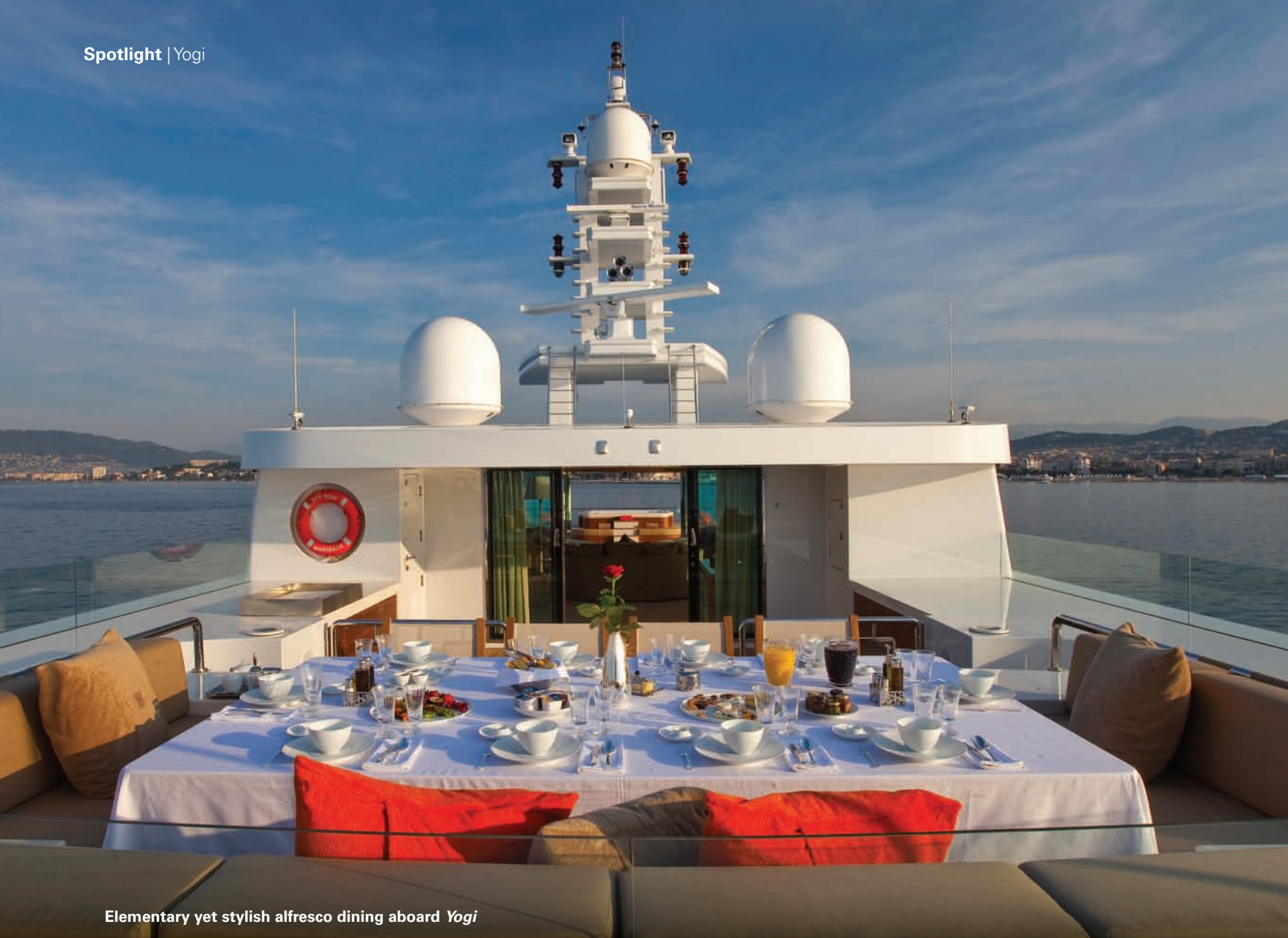
Elementary yet stylish alfresco dining aboard Yogi

The connection to the water is further enhanced by the large temperature-regulated swimming pool aft of the main deck—just one of the many significant design features onboard. With a clear glass front panel and a glazed skylight on the bottom, the sun's rays are reflected onto the vast beach club spaces below.