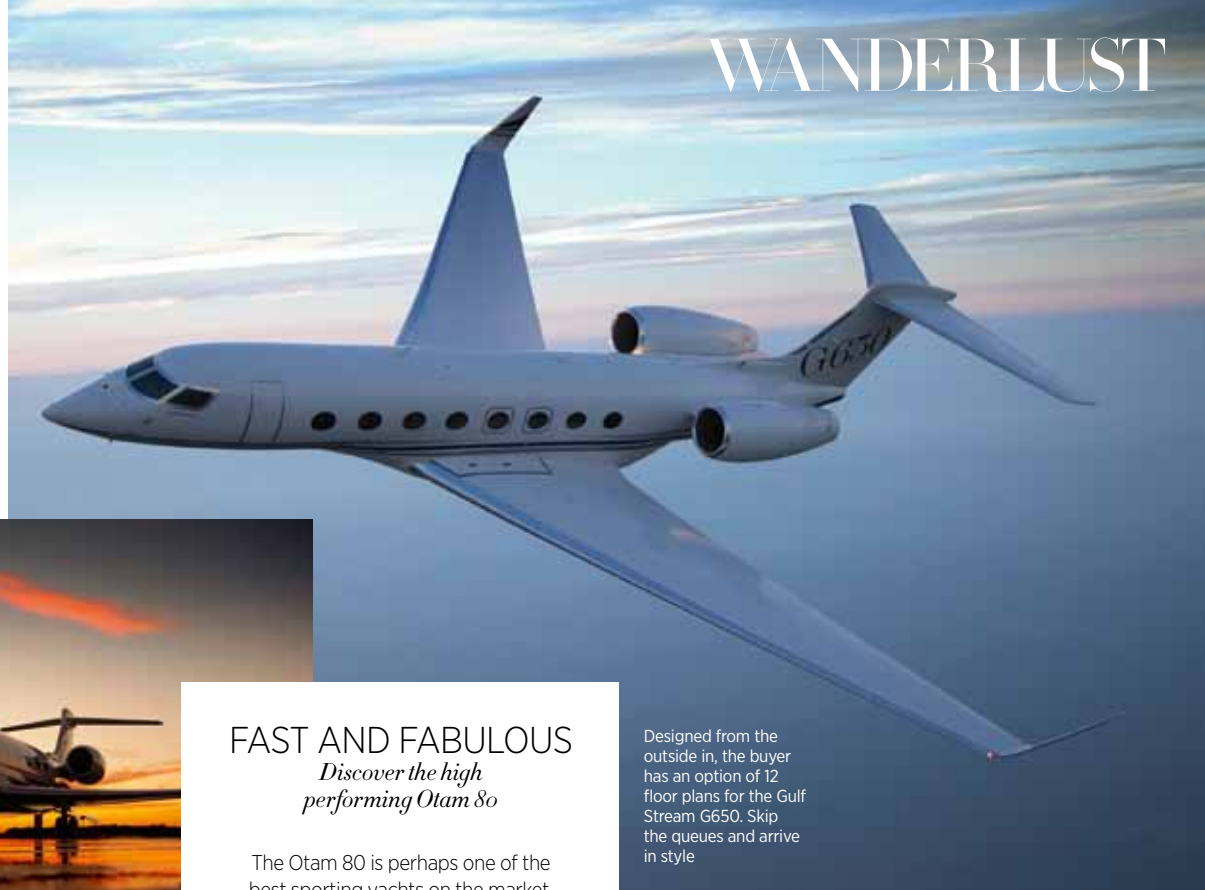
The G650 is the most technologically advanced business aircraft in the sky