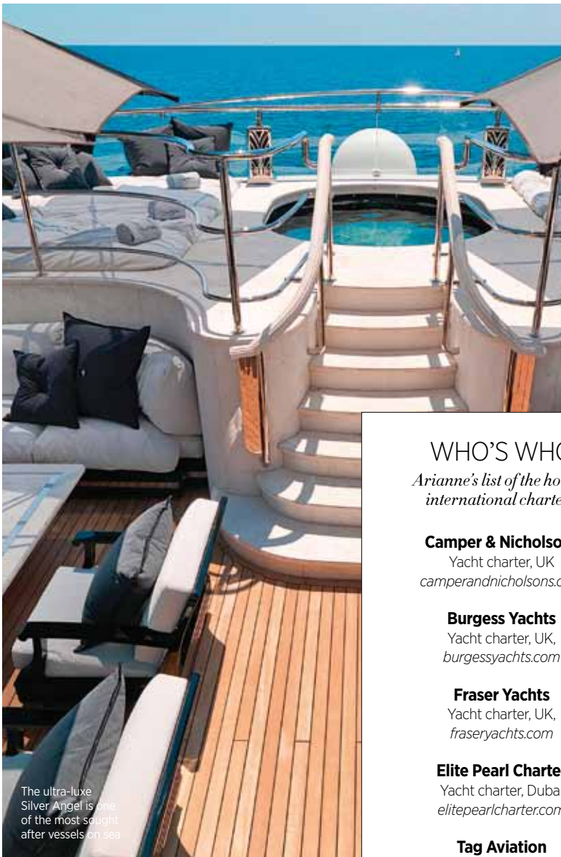
The ultra-luxe Silver Angel is one of the most sought after vessels on sea

extremely challenging. Responding to it creatively is even more onerous. It is potentially somewhere an affluent traveller will spend a vast amount of time so an earthy, calming palette is preferable, whilst some owners may enjoy a little excitement with a splash of accent shades.