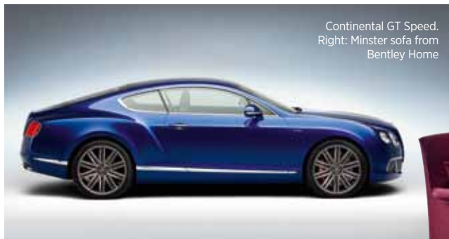
Continental GT Speed. Right: Minster sofa from Bentley Home

While this is undoubtedly a collection that would feel most at home in the executive penthouse – marble occasional tables, leather club chairs, walnut embossed dog bed, et al – the individual pieces from the Minster Sofa to the Madeley table recently launched at Salone del Mobile, would complement any of the region's homes. As for those of you already part of Bentley's exclusive owner's club, I have one piece of advice: Investing in furniture that bears the hallmark of your most beloved vehicle can only be a true symbol of your utter devotion. bentleymotors.com