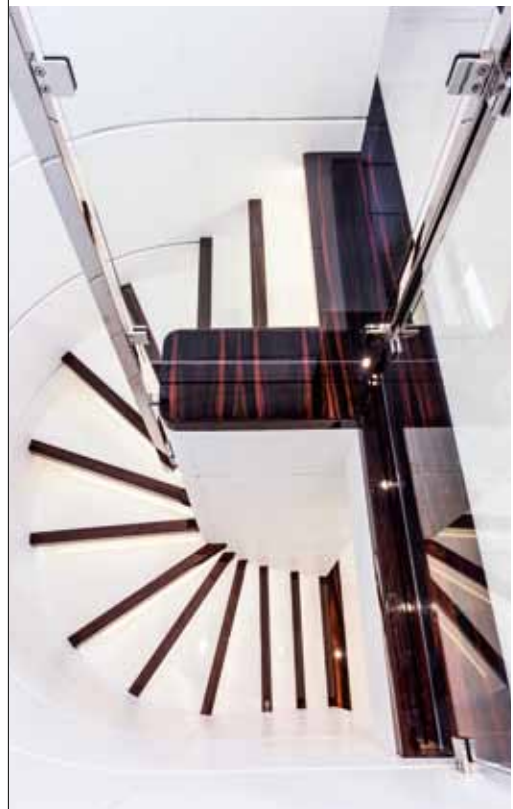
Above: The yacht Nameless features Italian décor by Luca Dini Design including marble and rare onyx. Below: Sleeping up to 11 guests Nameless is ideal for chartered vacations

Private jet charter, Dubai royaljetcharter.com