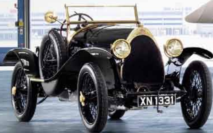
The fifth model in the exclusive six-part Legends Edition Type 18 "Black Bess" Bugatti