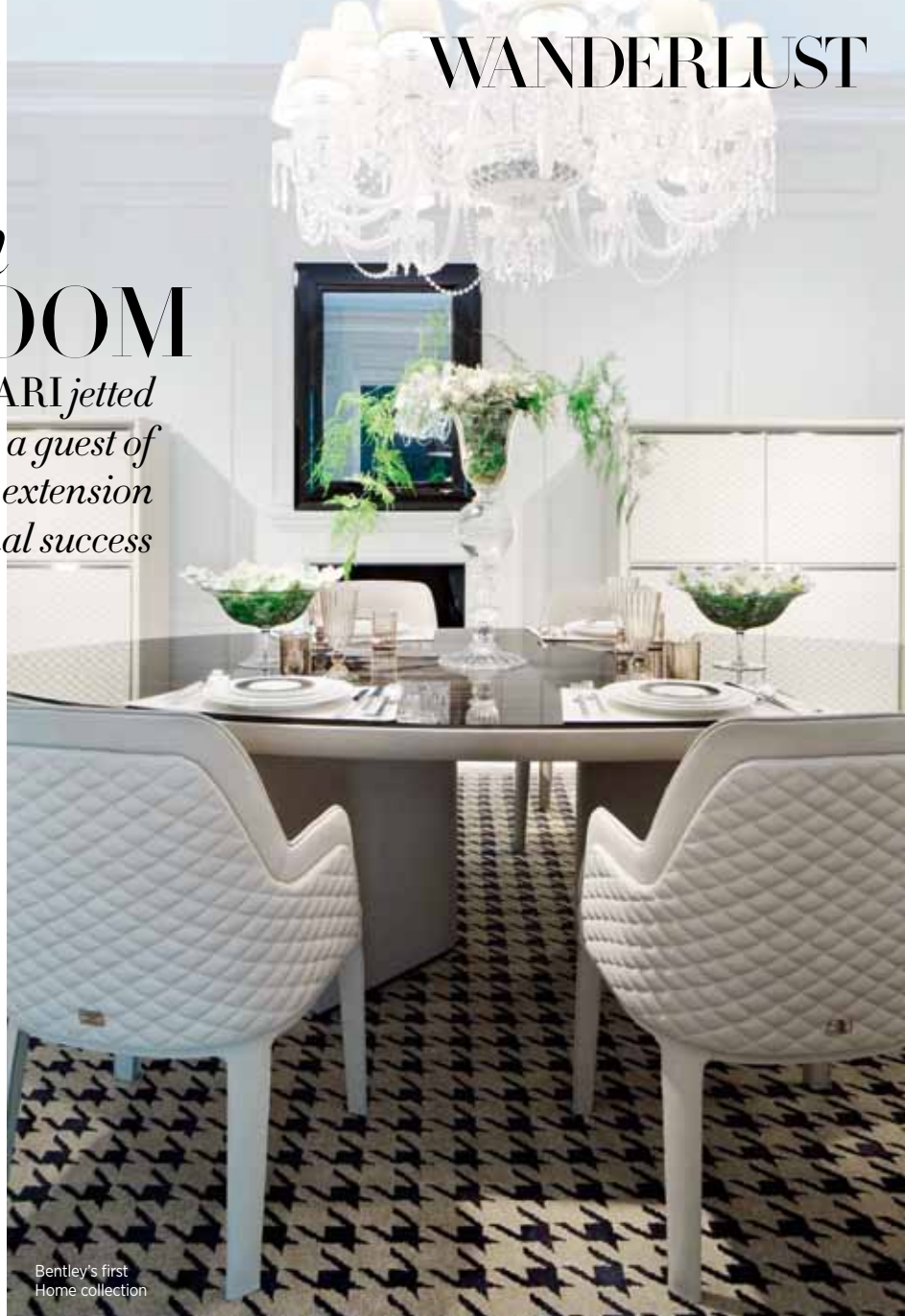
Bentley's first Home collection