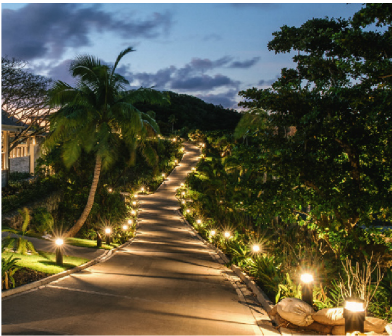
Left: the South Pacific resort has been designed to be in keeping with the island's natural environment, using Fijian traditions and local materials. Below: Walker's sailing yacht, also called Kokomo