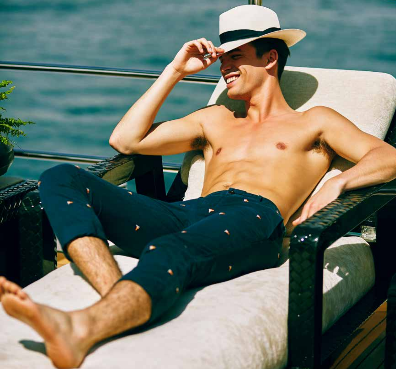
This page Shirt by Berluti, £310. Trousers, £115; belt £170, both by Tod's. Sunglasses by Ray-Ban, £87 Opposite Trousers by Polo Ralph Lauren, £145. Hat by Frescobol Carioca, £160