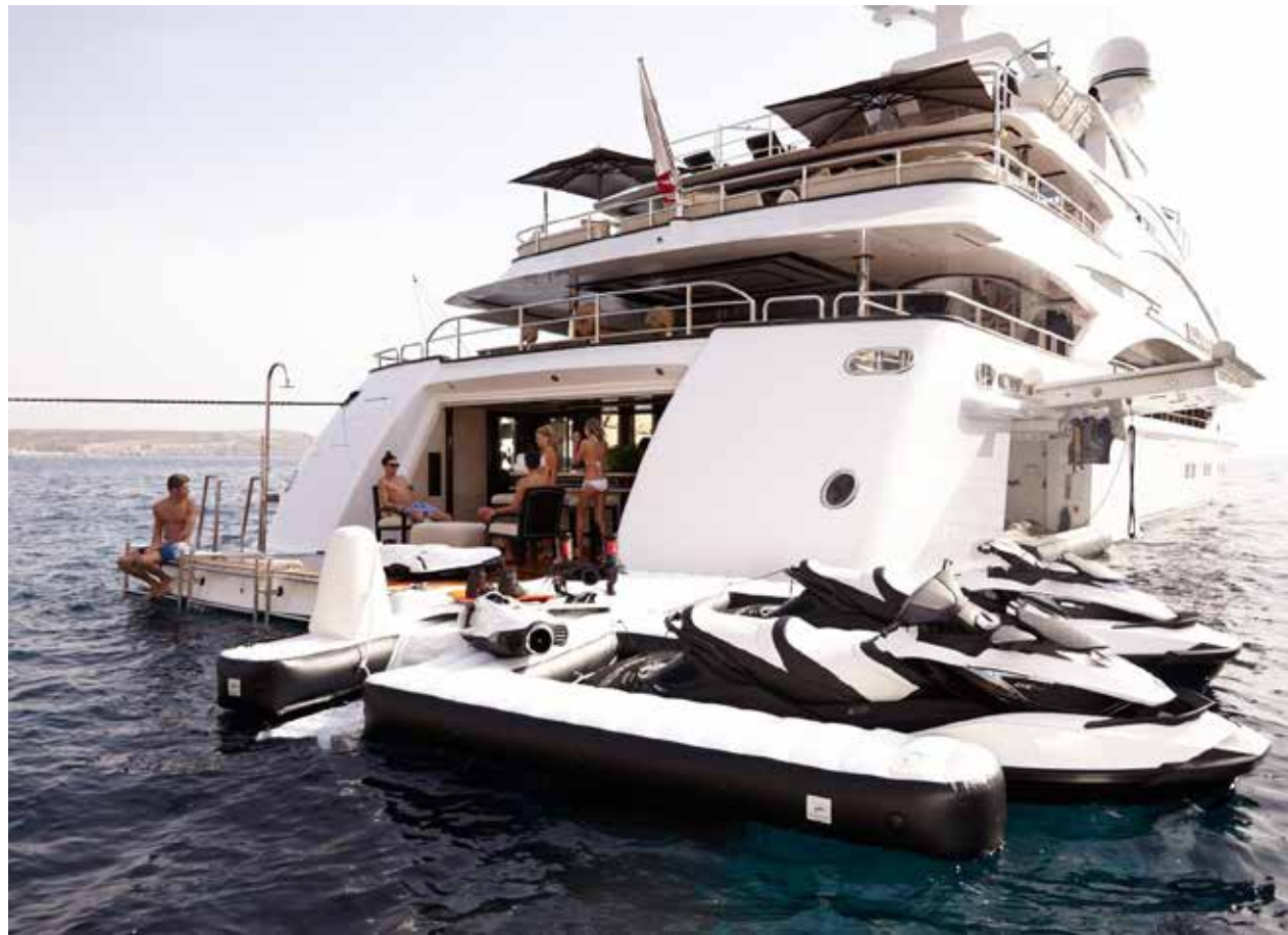
This page (top) Swim shorts from left to right: £150 Frescobol Carioca; £120, Vilebrequin; £120 by Vilebrequin This page (bottom left) Swim shorts by Frescobol Carioca , £150 This page (bottom right) Swim shorts by Robinson Les Bains, £150. Shirt by Robinson Les Bains, £154. Sunglasses by Westward Leaning, £170 Opposite Swim shorts by Frescobol Carioca, £150