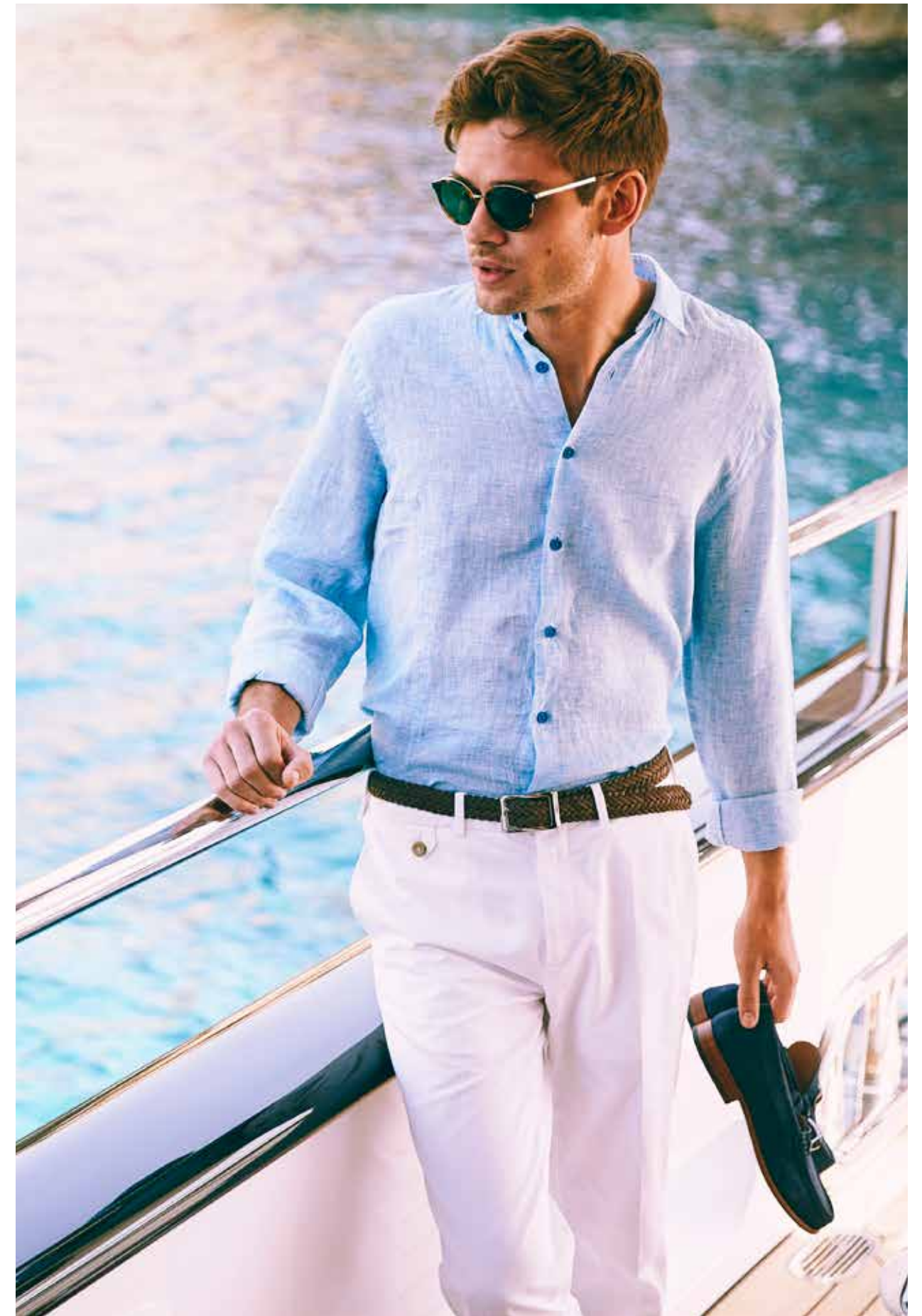
Opposite Shirt by Vilebrequin, £155. Trousers by Sunspel, £115 Top Shirt by Acne Studios, £160. Trousers by Hackett, £145. Belt £175; shoes £360, both by Tod's Above (left) Shirt by Orlebar Brown, £115 Above (right) Shirt by Canali, £175. Trousers by Polo Ralph Lauren, £145. Belt by Mulberry, £175. Sunglasses by Ray-Ban, £99