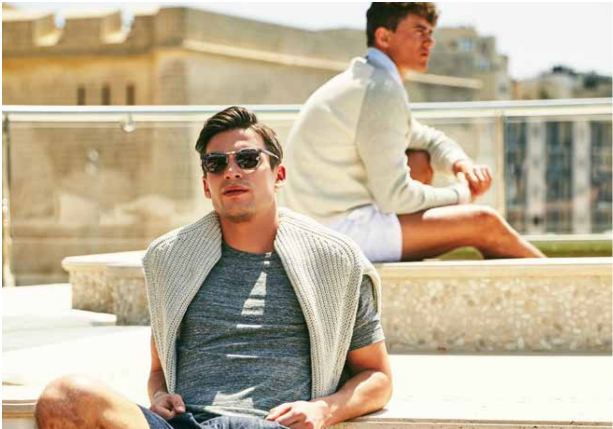
Previous page, left to right Shirt by Canali, £120. Swim shorts by Orlebar Brown, £175. Sunglasses model's own | Sweatshirt by Polo Ralph Lauren, £80. Swim shorts by Robinson Les Bains £150 | Swim shorts by Frescobol Carioca, £150. Sunglasses by Ray-Ban, £87 This page, top to bottom Sweatshirt by Polo Ralph Lauren, £80. Shirt by Canali, £120. Shorts by Polo Ralph Lauren £85 | T-Shirt by James Perse £85. Jumper by Folk, £135. Shorts by Gieves & Hawkes, £125. Shoes by Harrys of London, £345 Opposite, top to bottom Jacket by Hugo Boss, £630. Shirt by Vilebrequin, £155. Trousers by Gant, £130 | Jacket by dunhill £POA. Shirt by Theory, £185. Trousers by dunhill, £210 | Shirt by Turnbull & Asser, £200. Jacket by Boglioli, £440. Shorts by J.Crew, £65