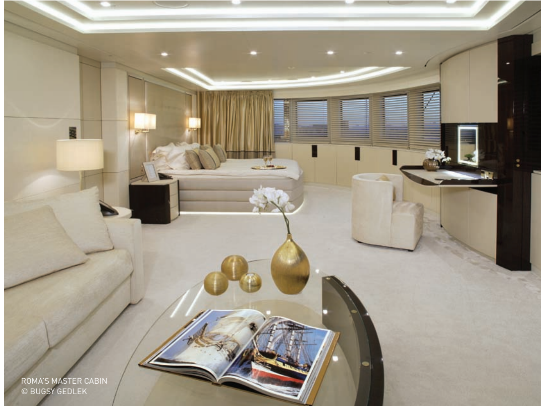
ROMA'S MASTER CABIN