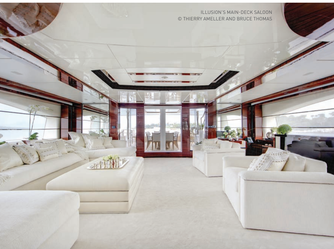
ILLUSION'S MAIN-DECK SALOON