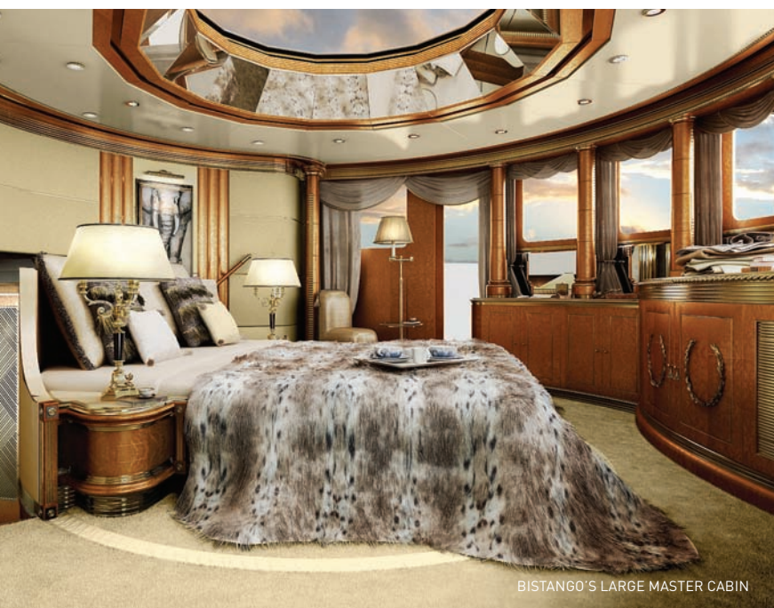
BISTANGO'S LARGE MASTER CABIN