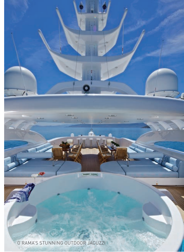
O'RAMA'S STUNNING OUTDOOR JACUZZI

Launched in spring, the 175'6/53.5m O'Rama has been meticulously designed. Created with the most discerning charter clients in mind, every detail has been executed to exacting standards. Her interior is replete with luxurious fabrics, solid oak, and African teak wood. Everything from wall linings to lamps having been custom made exclusively for her. Accommodation includes a main-deck master suite, and twin cabin, while on the upper deck there is a VIP cabin. Two further VIP cabins are located on the lower deck, along with two twin cabins, which can be connected to the doubles to create two large suites. Outside, O'Rama's decks are equally impressive. Her sun deck has shaded areas for comfortable relaxation, a Jacuzzi, sun-lounging pads, bar area and alfresco dining for the whole party. She also has a large lounging area on the foredeck perfect for sundowners. For the active guests, she has a gymnasium, and a garage full of toys, including wakeboards, water skis, jet skis, diving equipment, fishing rods, and kayaks, all accessible from her large swim platform. O'Rama also has all the latest cutting-edge media and audiovisual systems onboard.