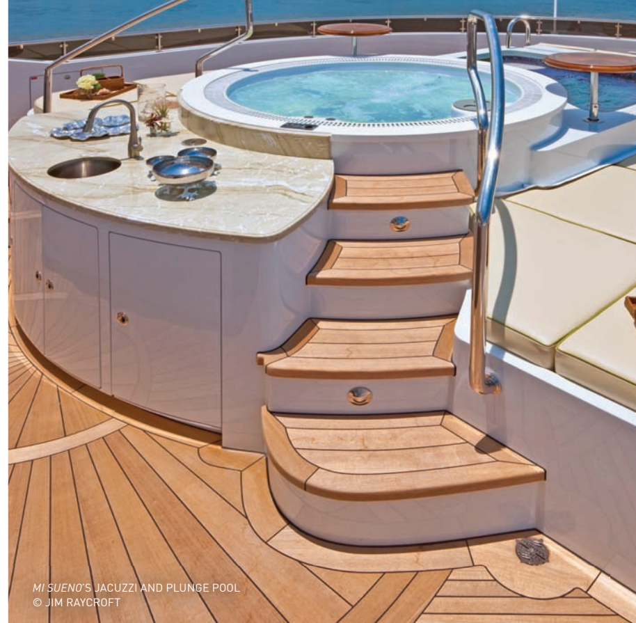
MI SUENO'S JACUZZI AND PLUNGE POOL