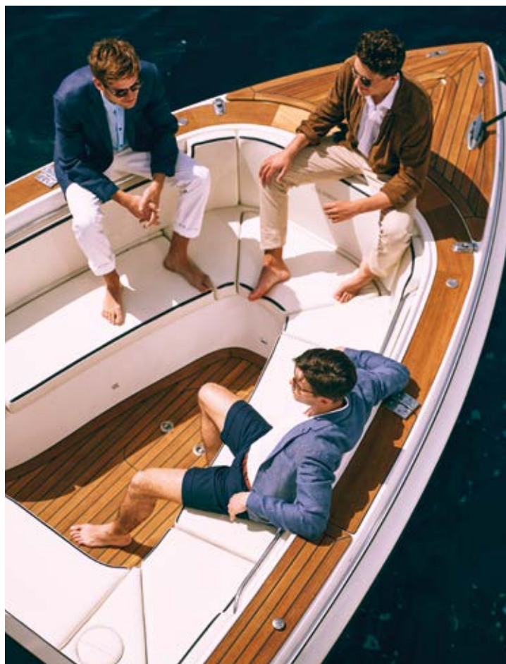
Illusion V is the perfect yacht for exploring the Mediterranean shores in style. Designed as a relaxed and stylish family home at sea, Illusion V 's external design is the result of the Benetti design team, with considerable input from the design duo Green & Mingarelli