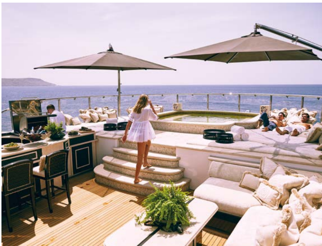
The sun deck on board Illusion V is spectacular, offering clear uninterrupted views from the rear sunloungers to the raised foredeck Jacuzzi area