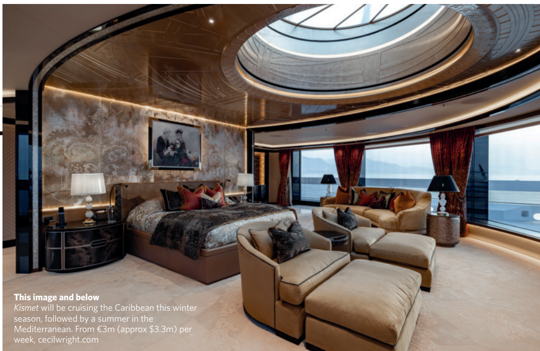
This image and below Kismet will be cruising the Caribbean this winter season, followed by a summer in the Mediterranean. From €3m (approx $3.3m) per week, cecilwright.com

Another example of a superb master suite can be found aboard the brand-new, 400.3-ft Kismet . The master suite is not just an owner's deck but spans two levels. "The dedicated suite includes a master stateroom, complete with a huge skylight and fireplace, his and hers bathrooms, his and hers dressing rooms, and a beauty salon," says Liz Cox, partner at Cecil Wright. "A private Jacuzzi and sunbathing area are located forward, while a staircase leads to the master office, where panoramic views encourage productivity but are also a welcome distraction."