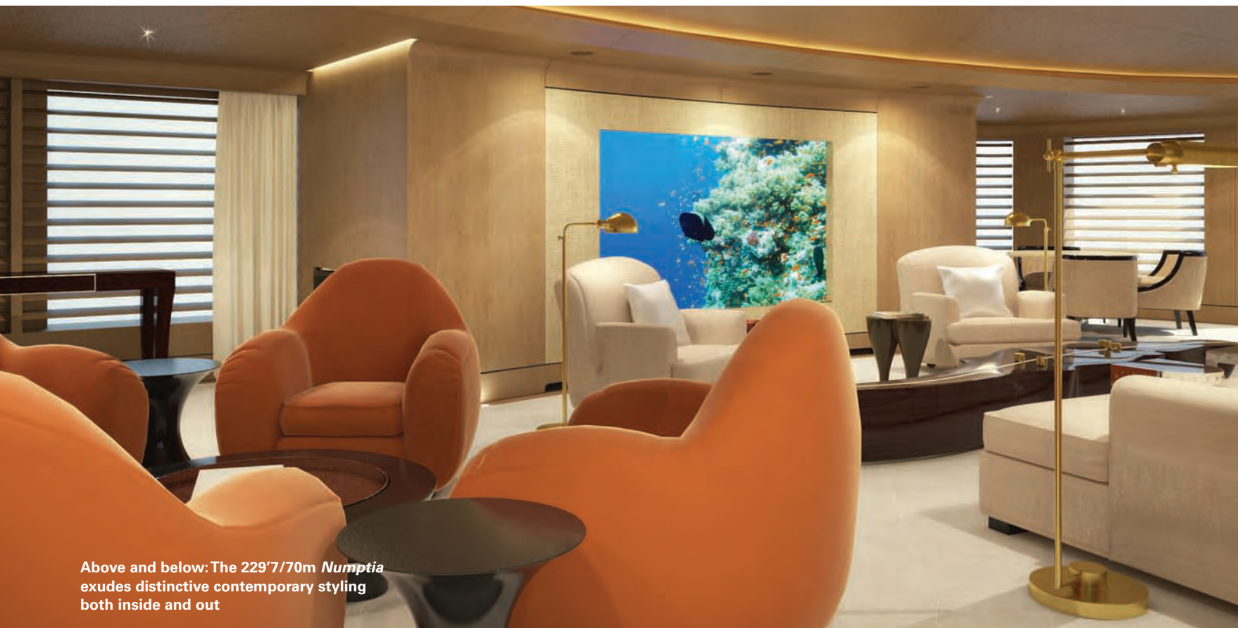
Above and below: The 229'7/70m Numptia exudes distinctive contemporary styling both inside and out

The summer season may have come to an end but there are plenty of spectacular new yachts making their debut this autumn and gearing up for their first winter season of charters.