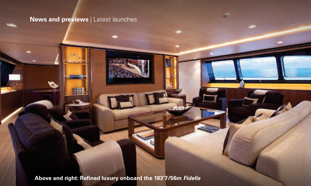
Above and right: Refined luxury onboard the 183'7/56m Fidelis