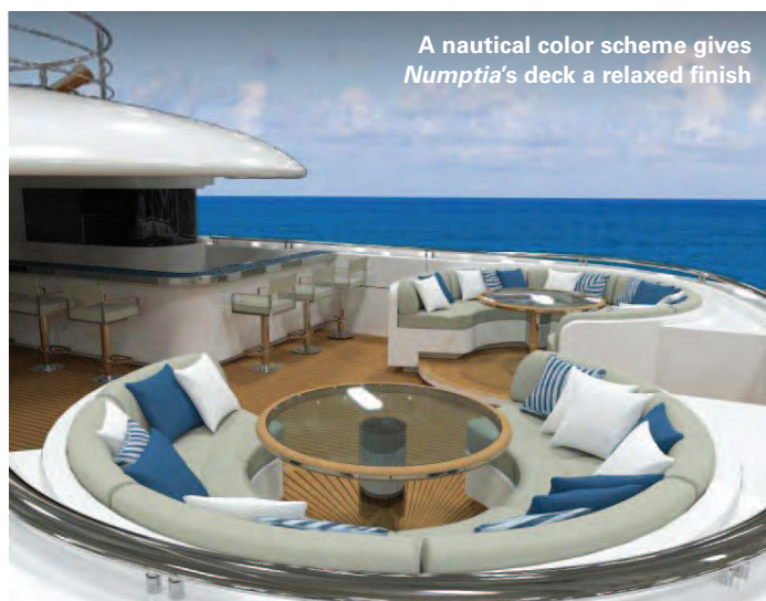
A nautical color scheme gives Numptia 's deck a relaxed finish