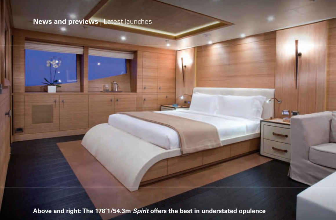
Above and right: The 178'1/54.3m Spirit offers the best in understated opulence