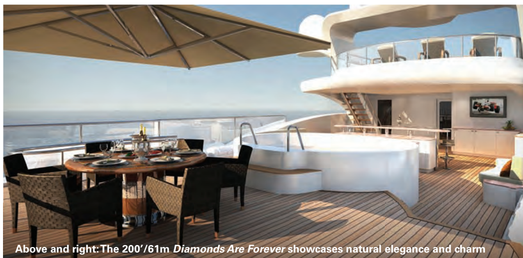
Above and right: The 200'61m Diamonds Are Forever showcases natural elegance and charm