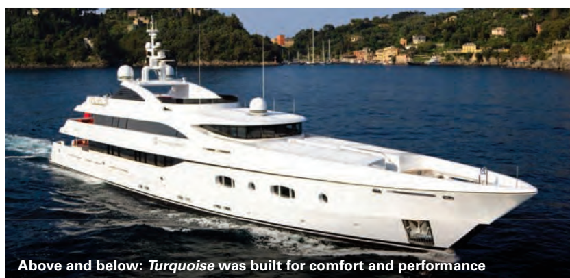
Above and below: Turquoise was built for comfort and performance