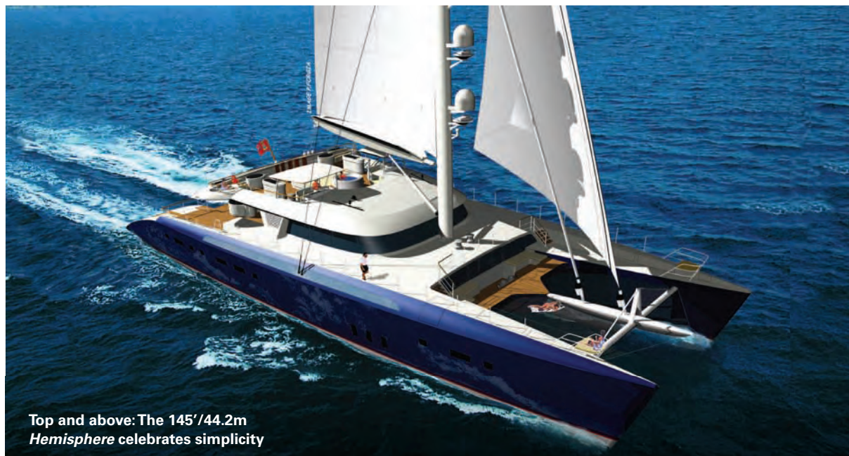
Top and above: The 145'/44.2m Hemisphere celebrates simplicity