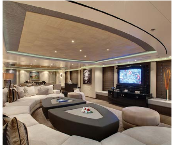
ABOVE The luxurious interiors aboard Hurricane Run